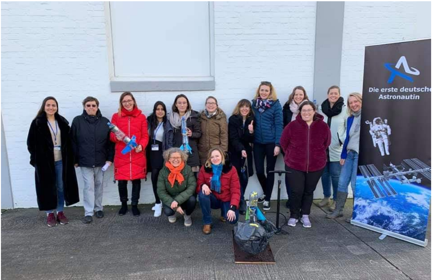
WIA-E Bremen and Die Astronautin team after the water rocket launch campaign.

Space makes you dream and we dream of a modern society with gender equality and inclusion