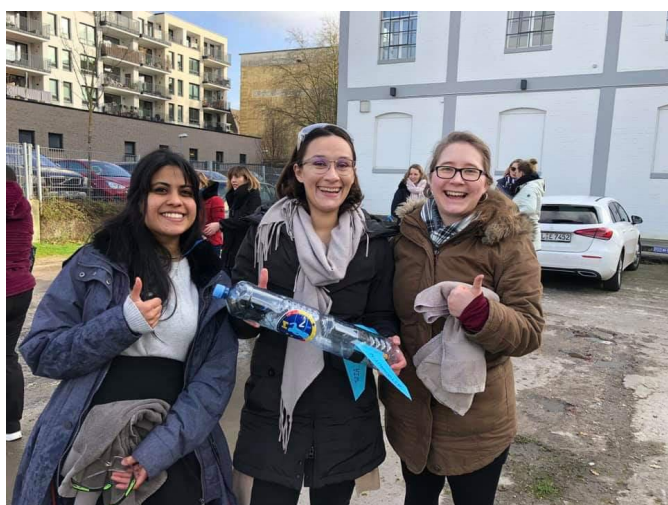
WIA-E Bremen participants during the launch campaign!

The second day is dedicated to the session NAVIGATE and GO. A virtual reality tour inside ISS completes the experience, providing a unique feeling about the perception of our body and reality.